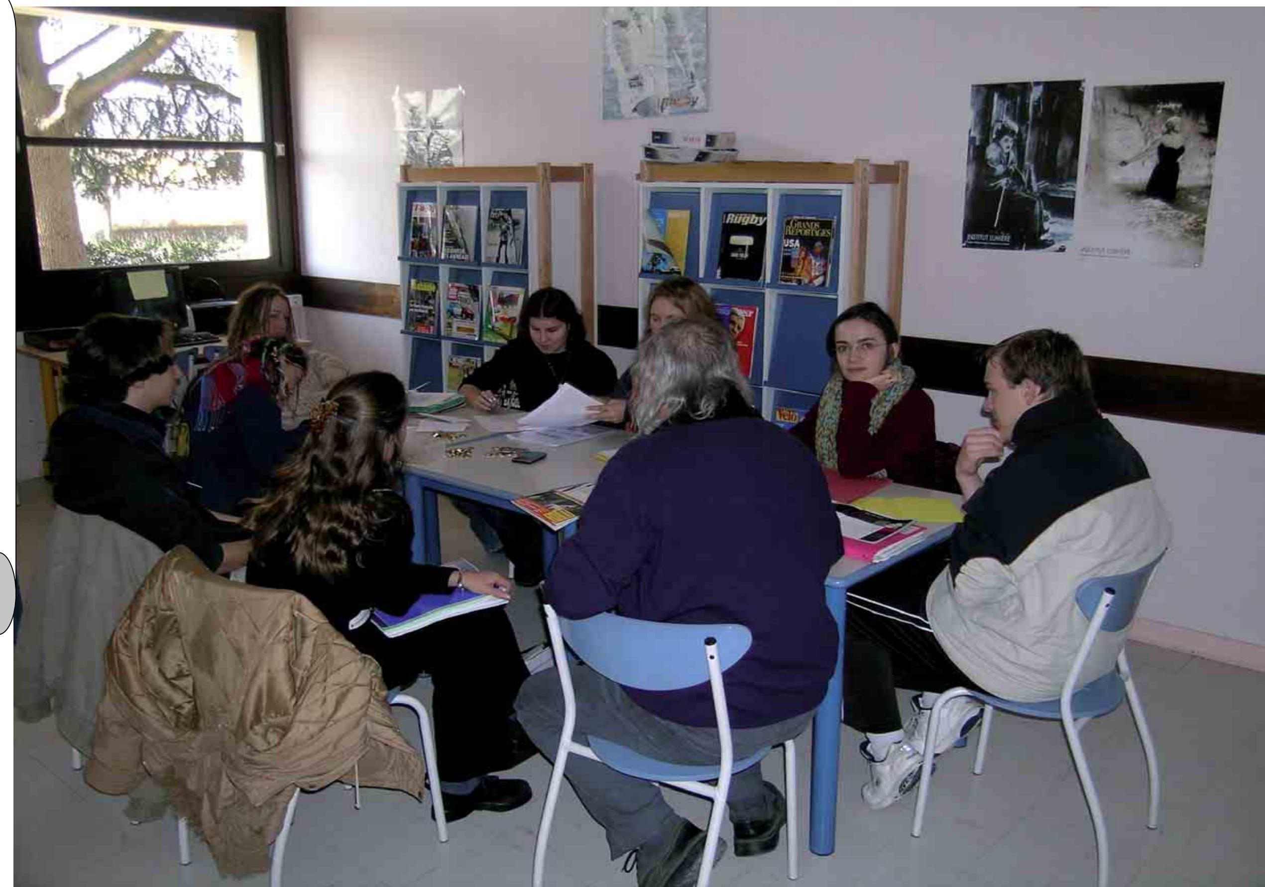
DO WE BELIEVE WE HAVE POWER TO CHANGE ?