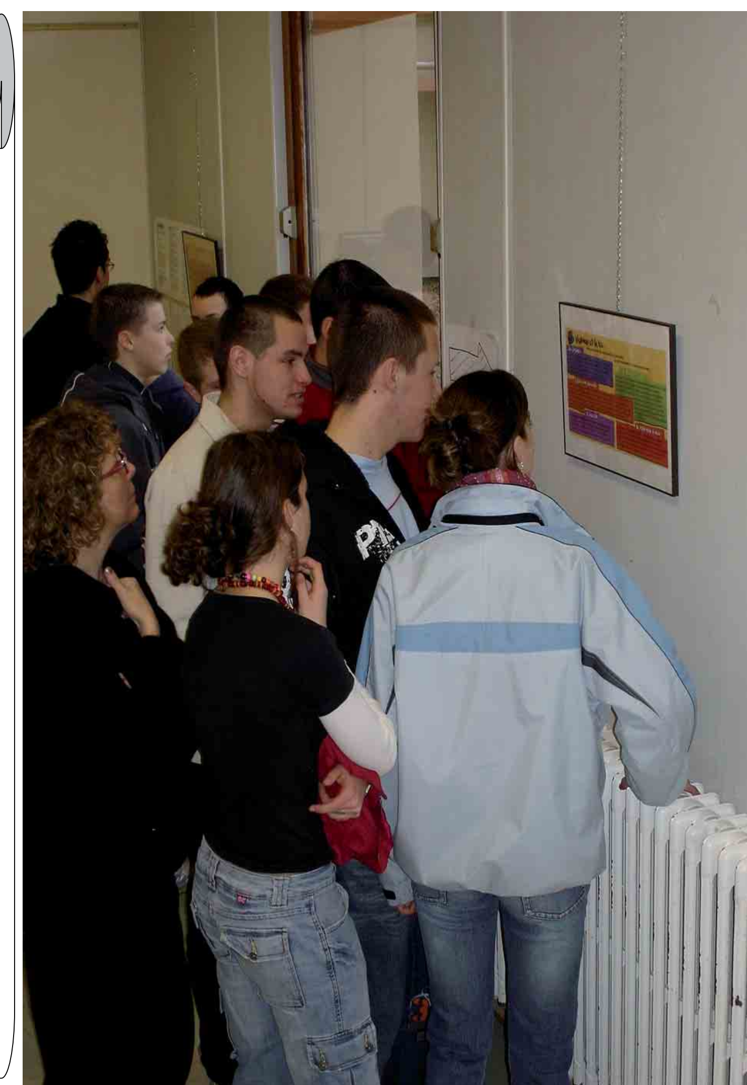
SUGGES-TIONS MADE BY STU-DENTS