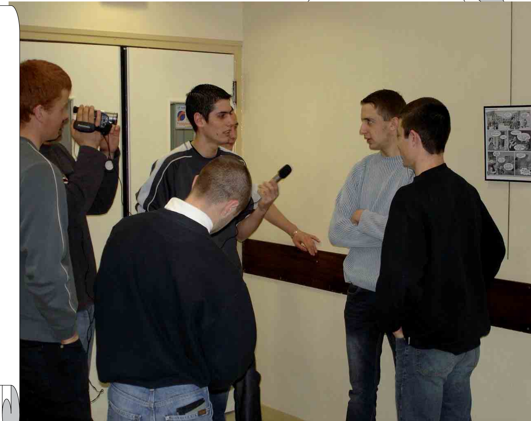
WHAT ARE STUDENTS DESIRES ?

Some way to check what was concretely done :