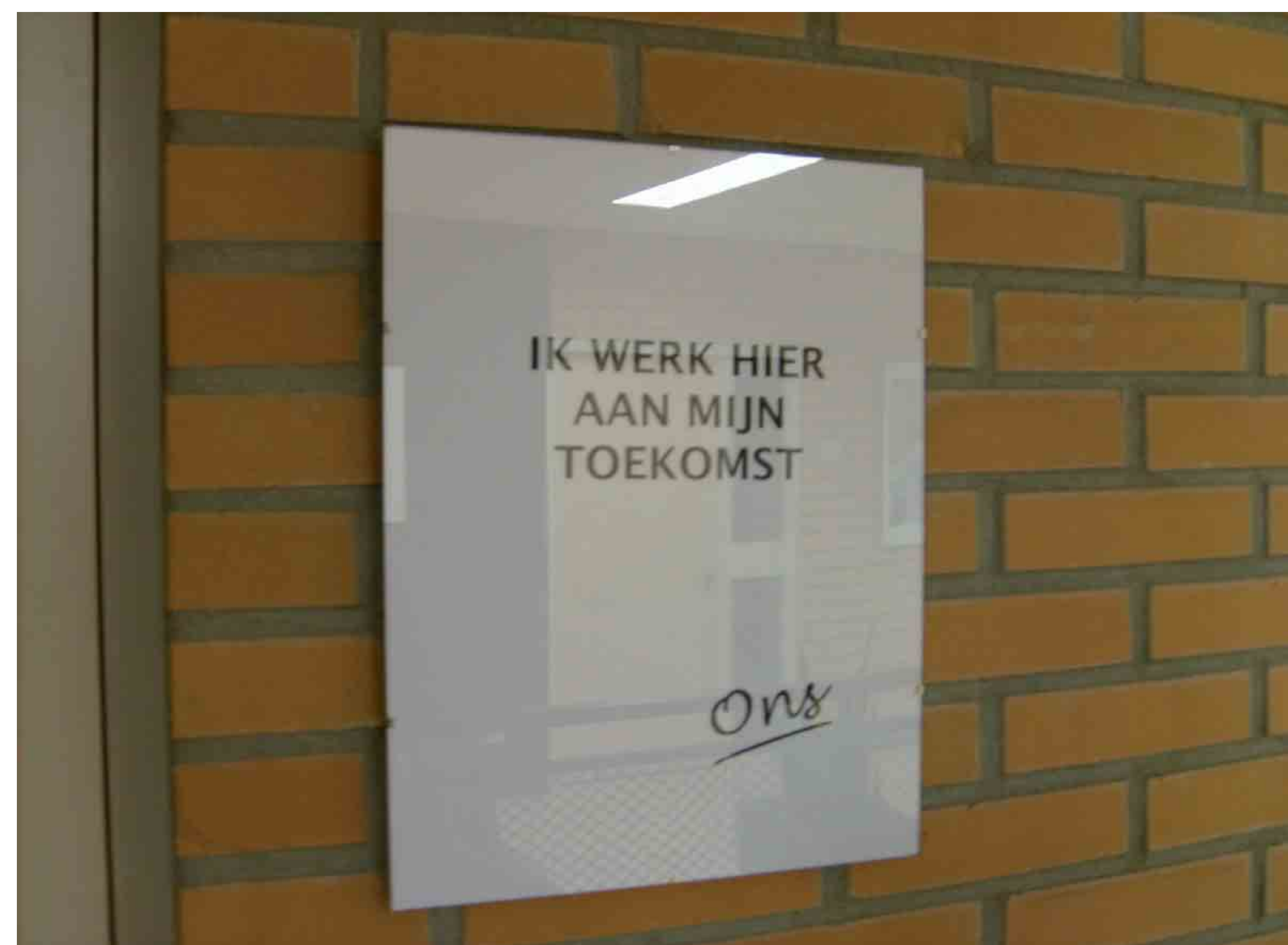
YES WE HAVE POWER